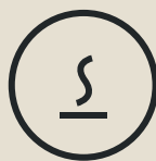
DYNAVOX® Raw material sterilization and vaporization