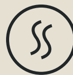
SARA ADVANCED® Extraction of volatiles and sensory standardization