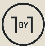
ONEBYONE® Individual cork testing

We naturally embrace nature with the best technology