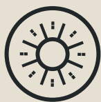
NEOTECH® Granules sterilization and vaporization