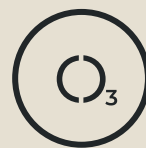
MASZONE® Elimination of microorganisms